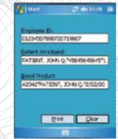
Label Printing on Windows Mobile Device